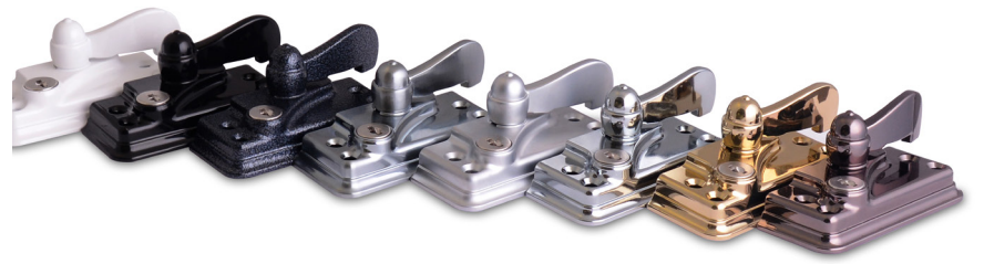
White • Black • Antique Black • Graphite • Satin • Chrome • Gold • Bronze