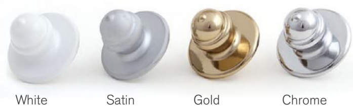
White Satin Gold Chrome