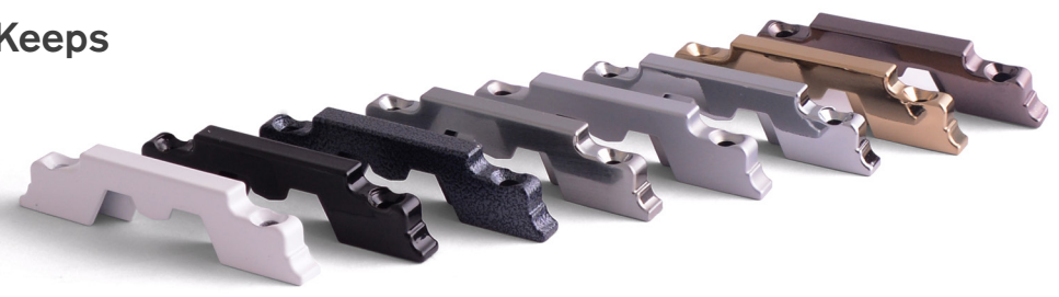
White • Black • Antique Black • Graphite • Satin • Chrome • Gold • Bronze